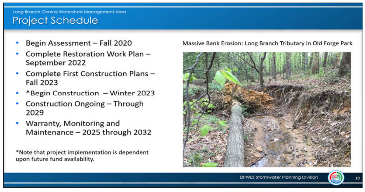
Figure 1. Overall schedule

Charles Smith can also be contacted with questions at 703-324-5500 or <a href="mailto:Charles.smith@fairfaxcounty.gov">Charles.smith@fairfaxcounty.gov</a>. A few relevant screenshots are shown below; additional information is available on the County website. The anticipated project schedule is shown in Figure 1.