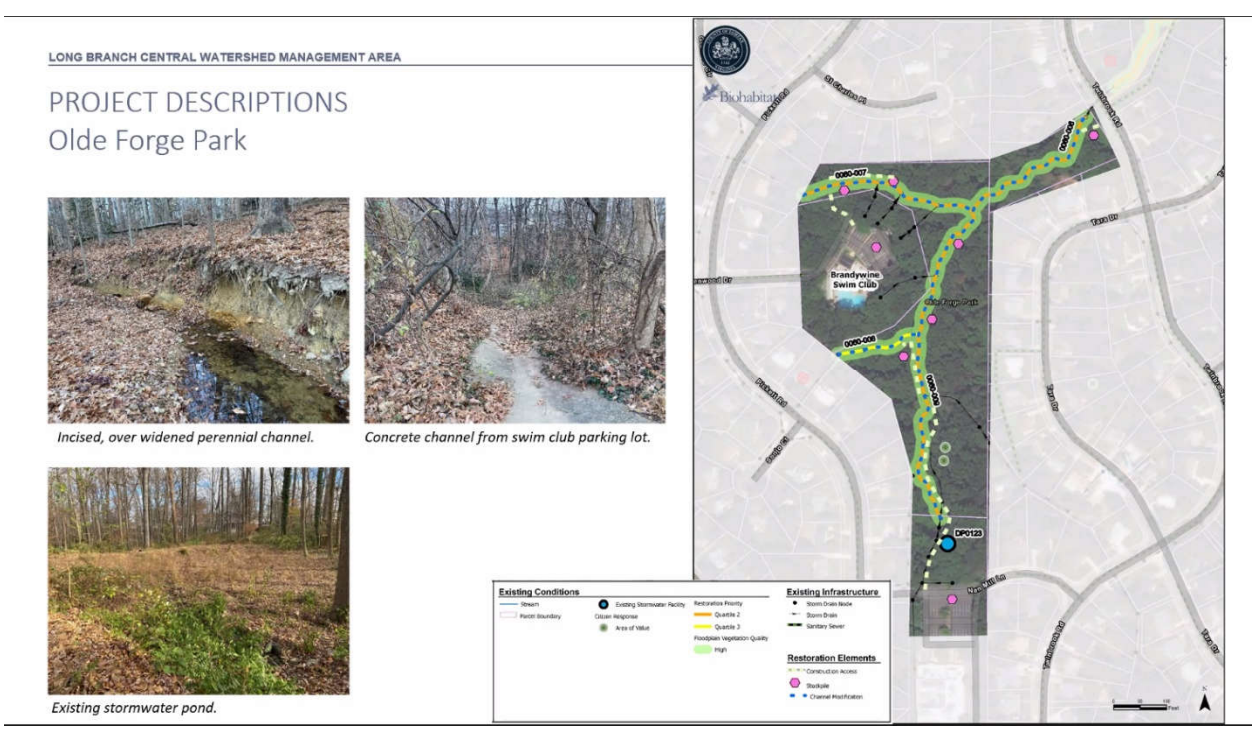
Figure 2. Olde Forge Park Projects

Some of the projects are shown below and in the map at right. More detail can be found on the County website.